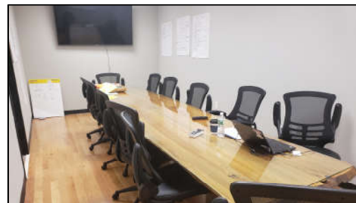
Our classroom is adjacent to the equipment showroom to facilitate hands on training.