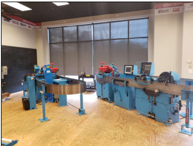
Left Image - Manual Loop. #4 Sharpener with Control Tower and 5' Filing Clamp. Right Image - Automated Loop. VariSharp with AutoSwage and 3' Filing Clamp.

Equipment showroom is open by appointment only. 1910 N Cashua Dr, Florence, SC