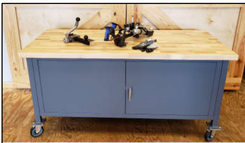
Six foot work bench will accommodate several students during tool set up.